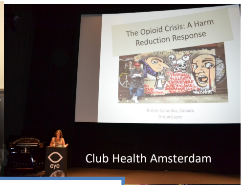
Club Health Amsterdam