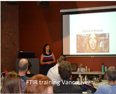
FTIR training Vancouver