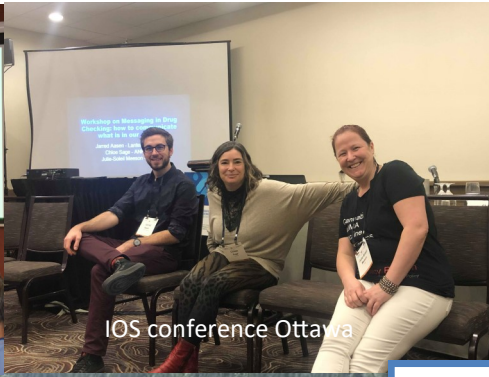
IOS conference Ottawa